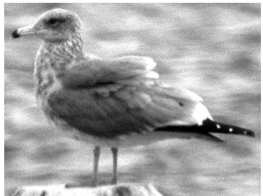
California Gull, 27 October 2007, Guntersville, AL