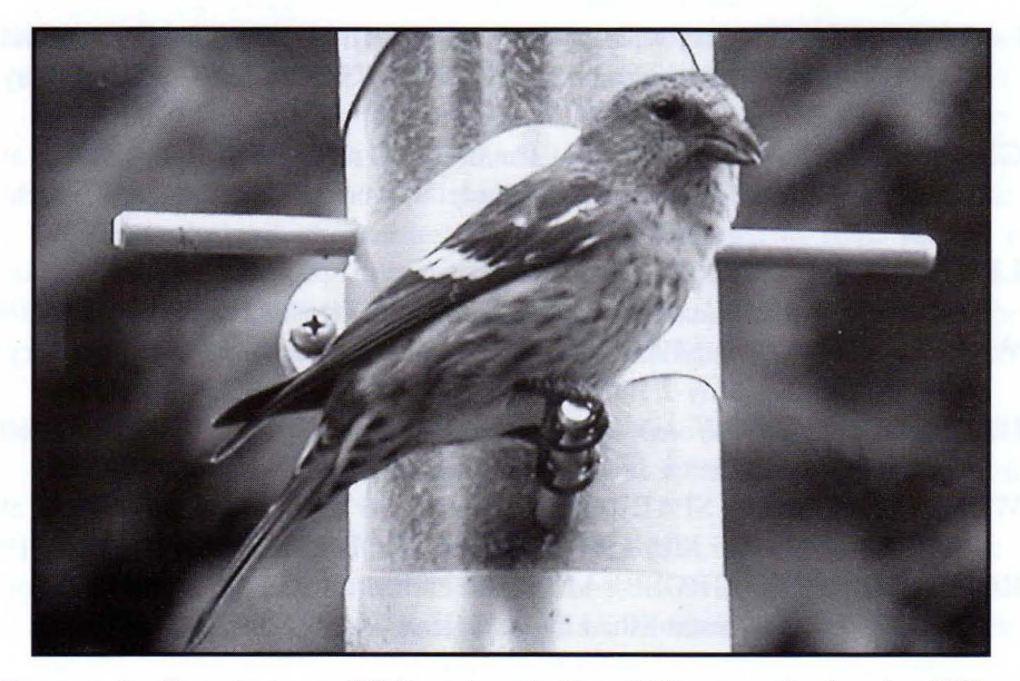
FIGURE 1. Female-type White-winged Crossbill at a feeder in Killen, Lauderdale Co., AL, 26 April and 5-20 May.